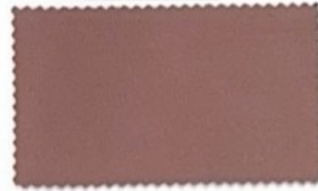
Shade No. - 07