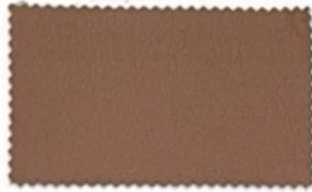
Shade No. - 06