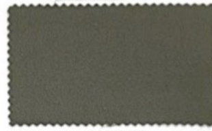
Shade No. - 13