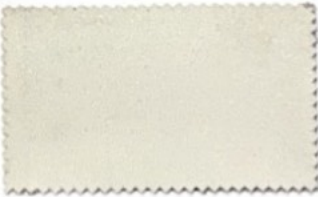
Shade No. - 01