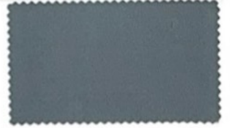
Shade No. - 12