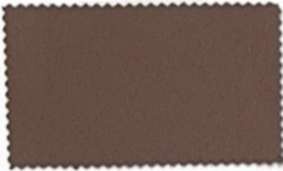
Shade No. - 05