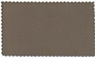
Shade No. - 03