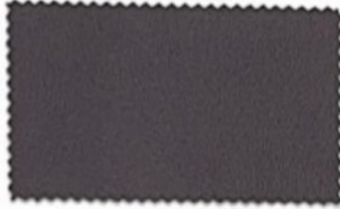
Shade No. - 04