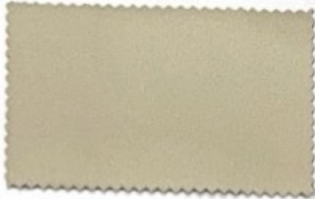
Shade No. - 02