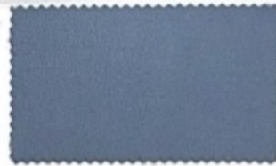
Shade No. - 14