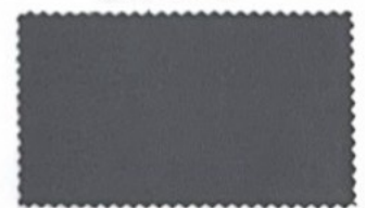
Shade No. - 11