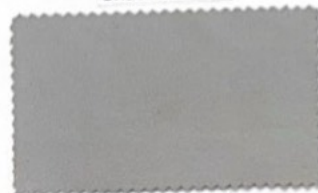
Shade No. - 09