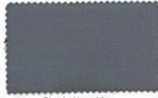
Shade No. - 10