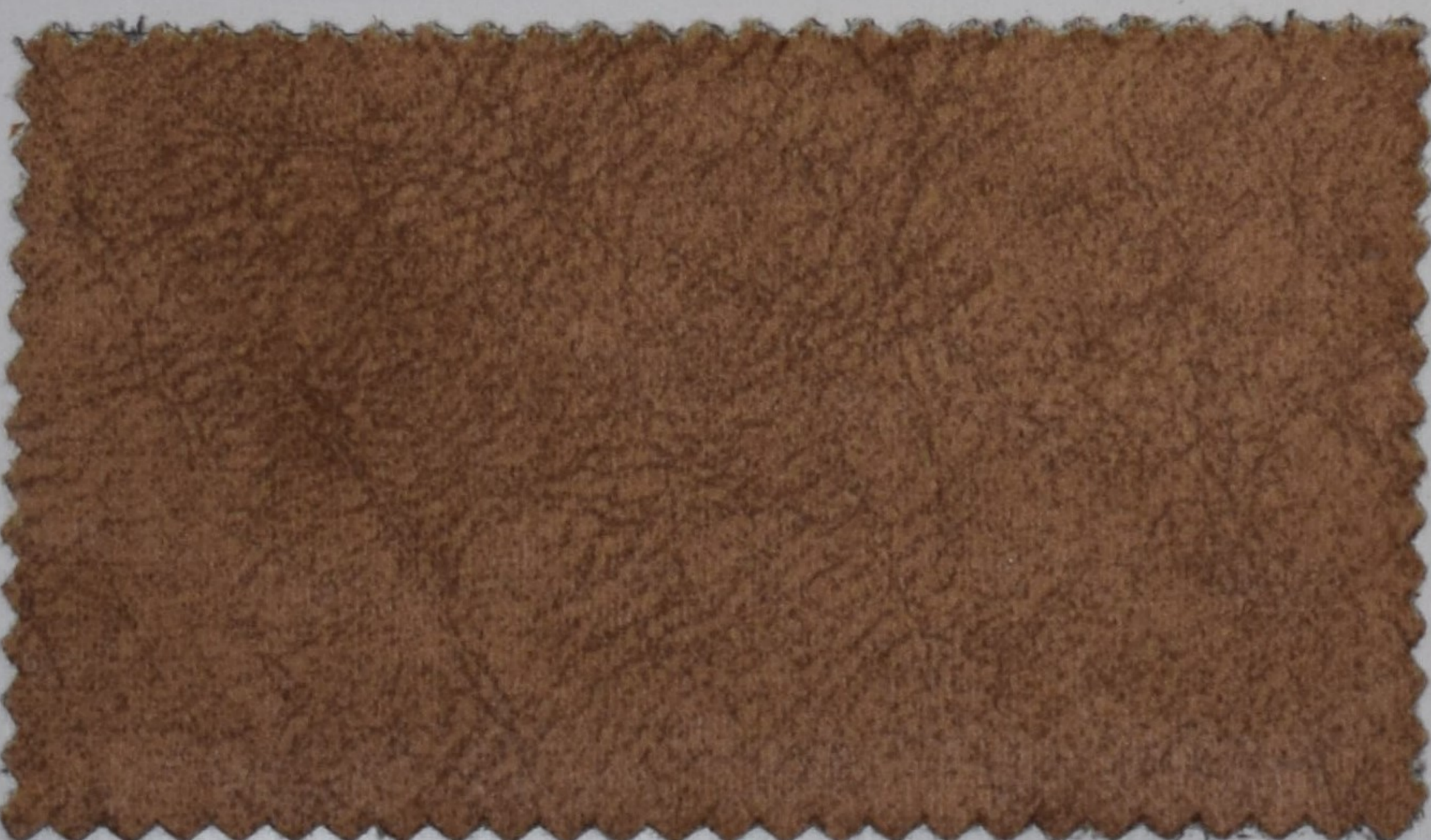
Shade No.- 112