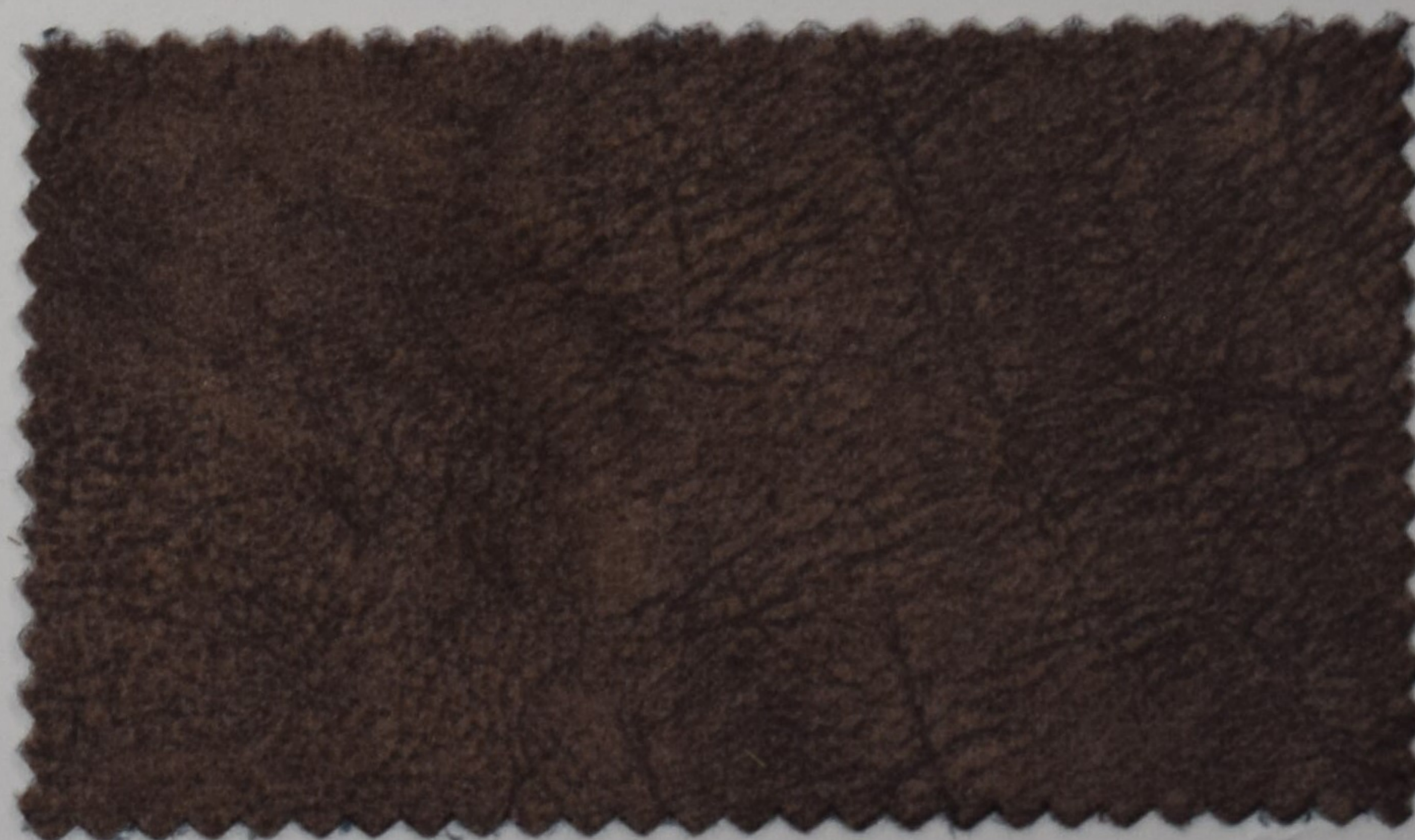
Shade No.- 121