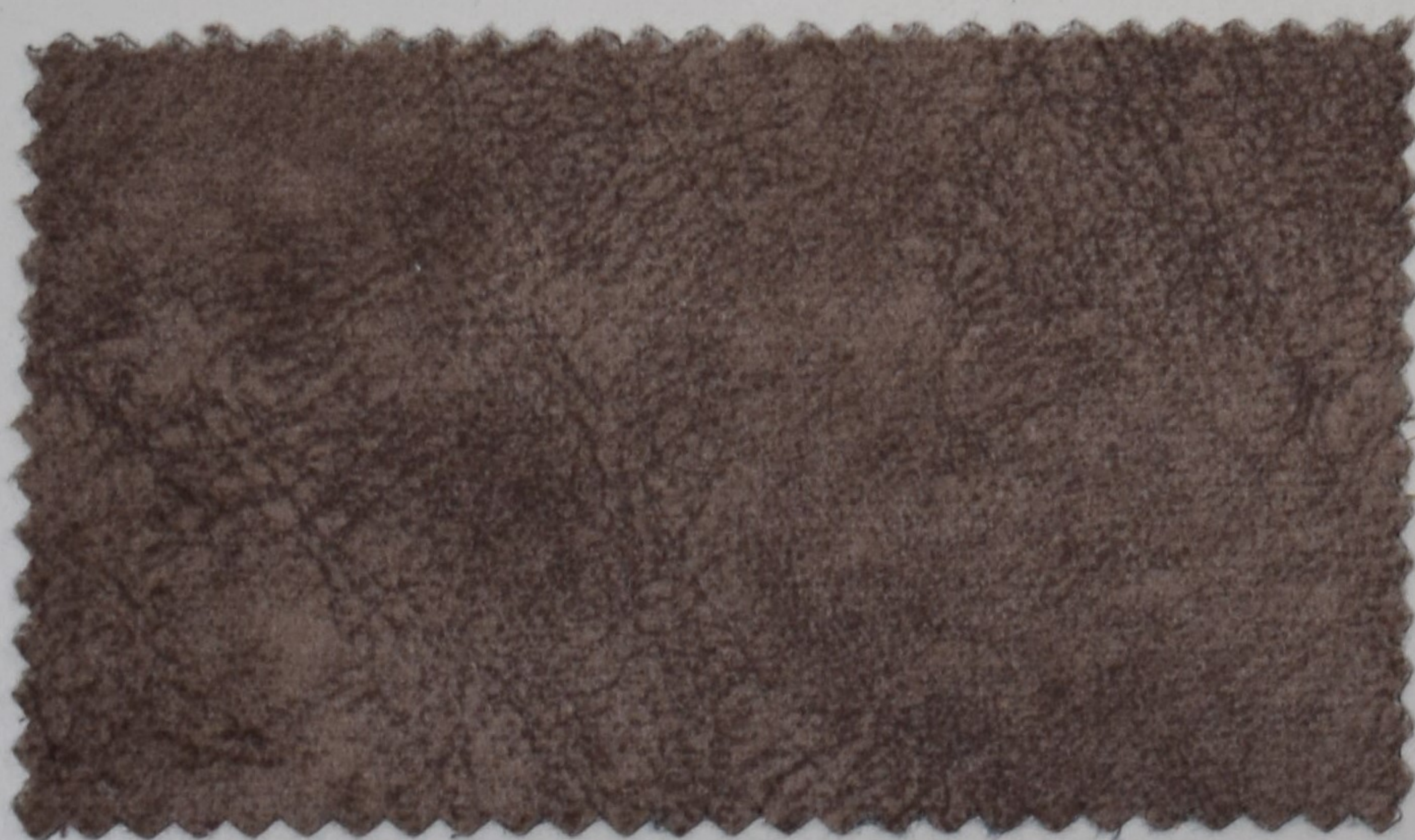
Shade No.- 120