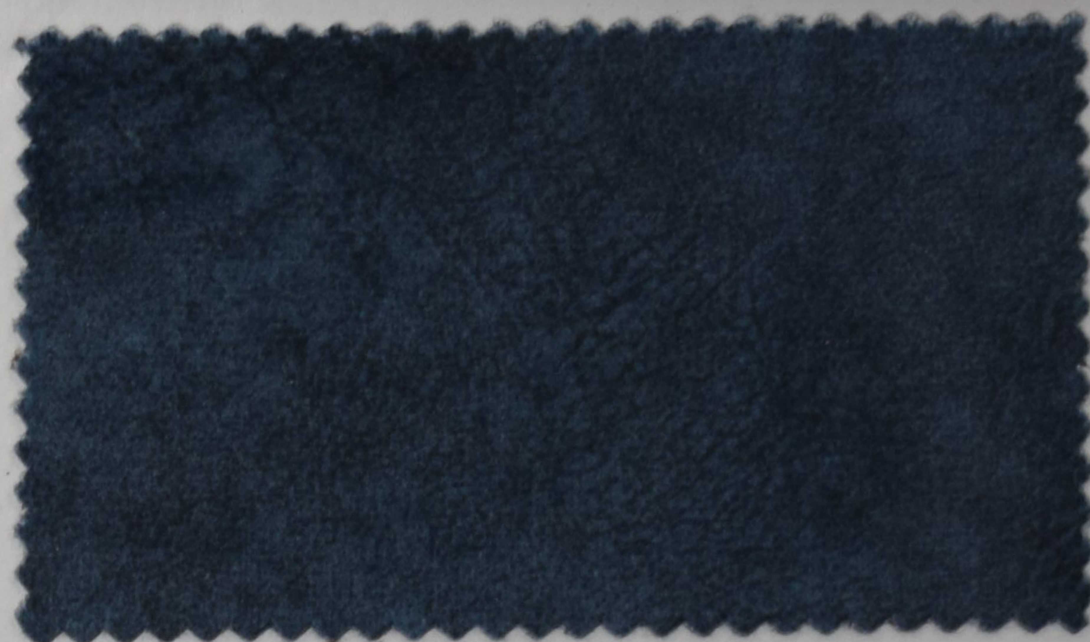
Shade No.- N. BLUE