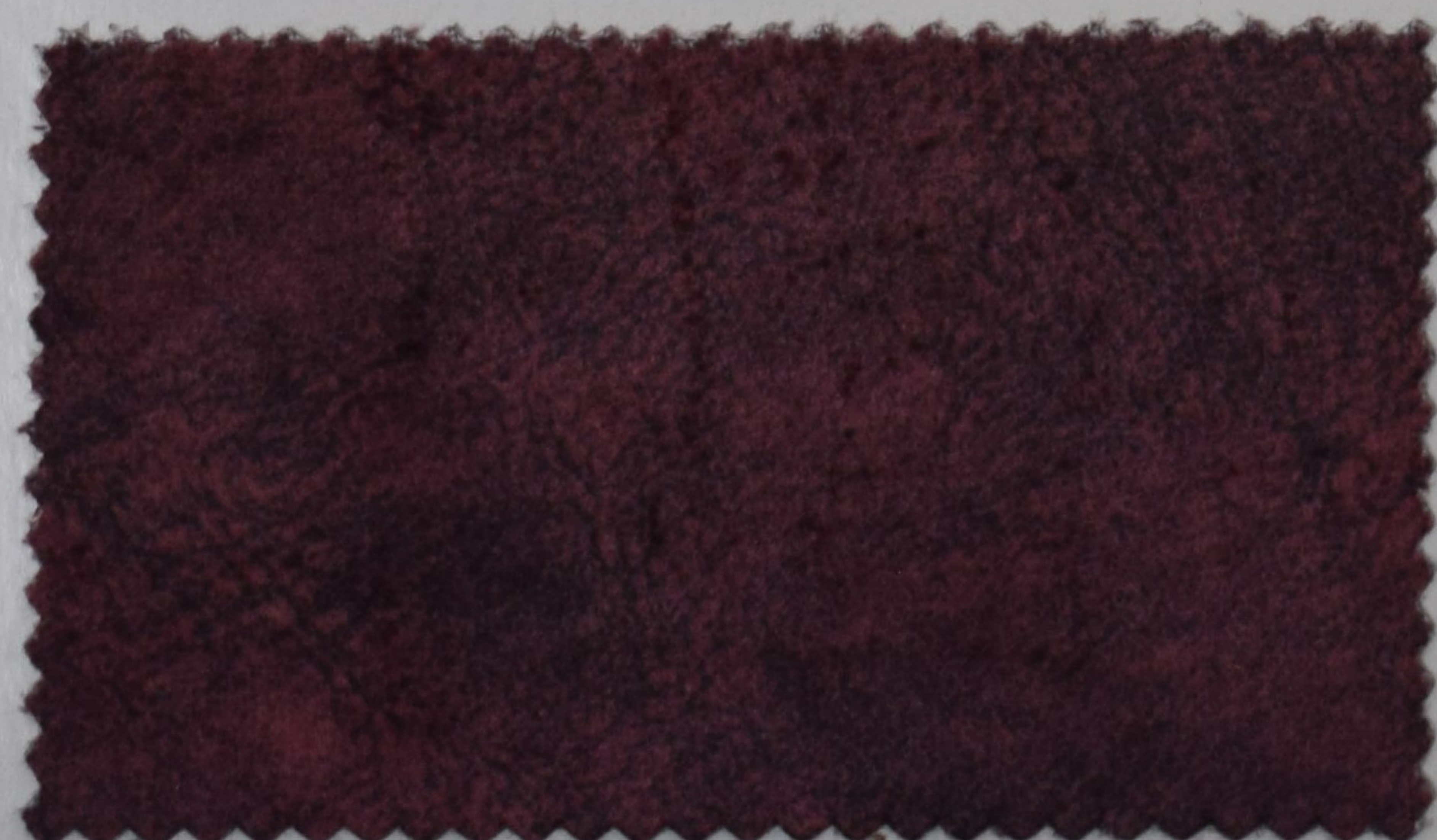
Shade No.- 117