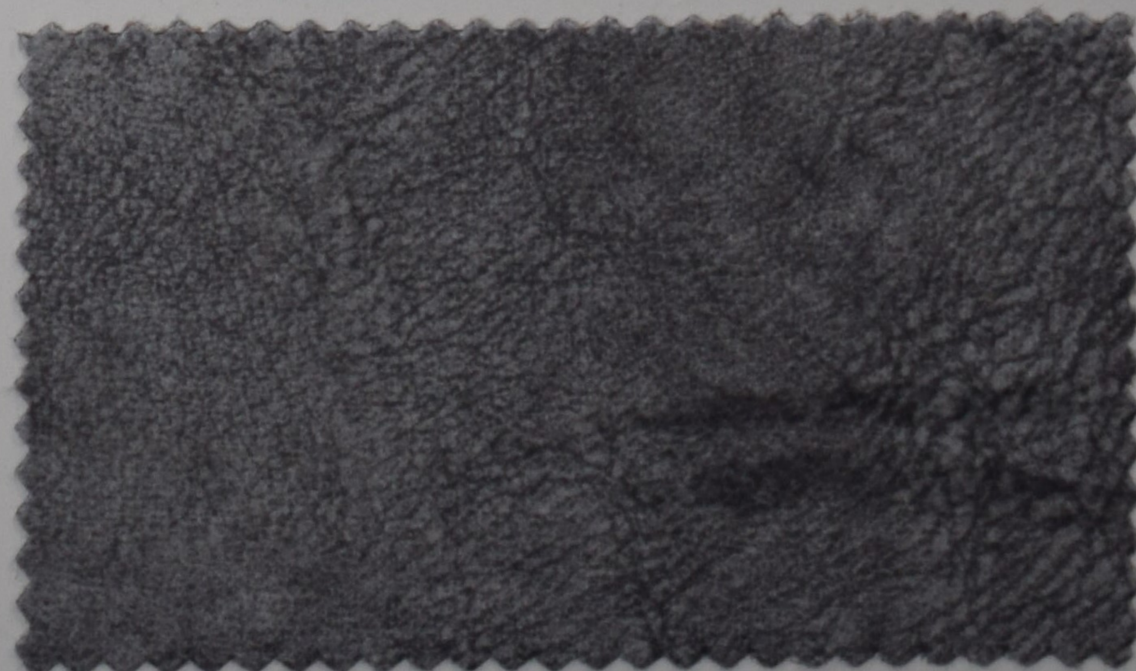
Shade No.- 119