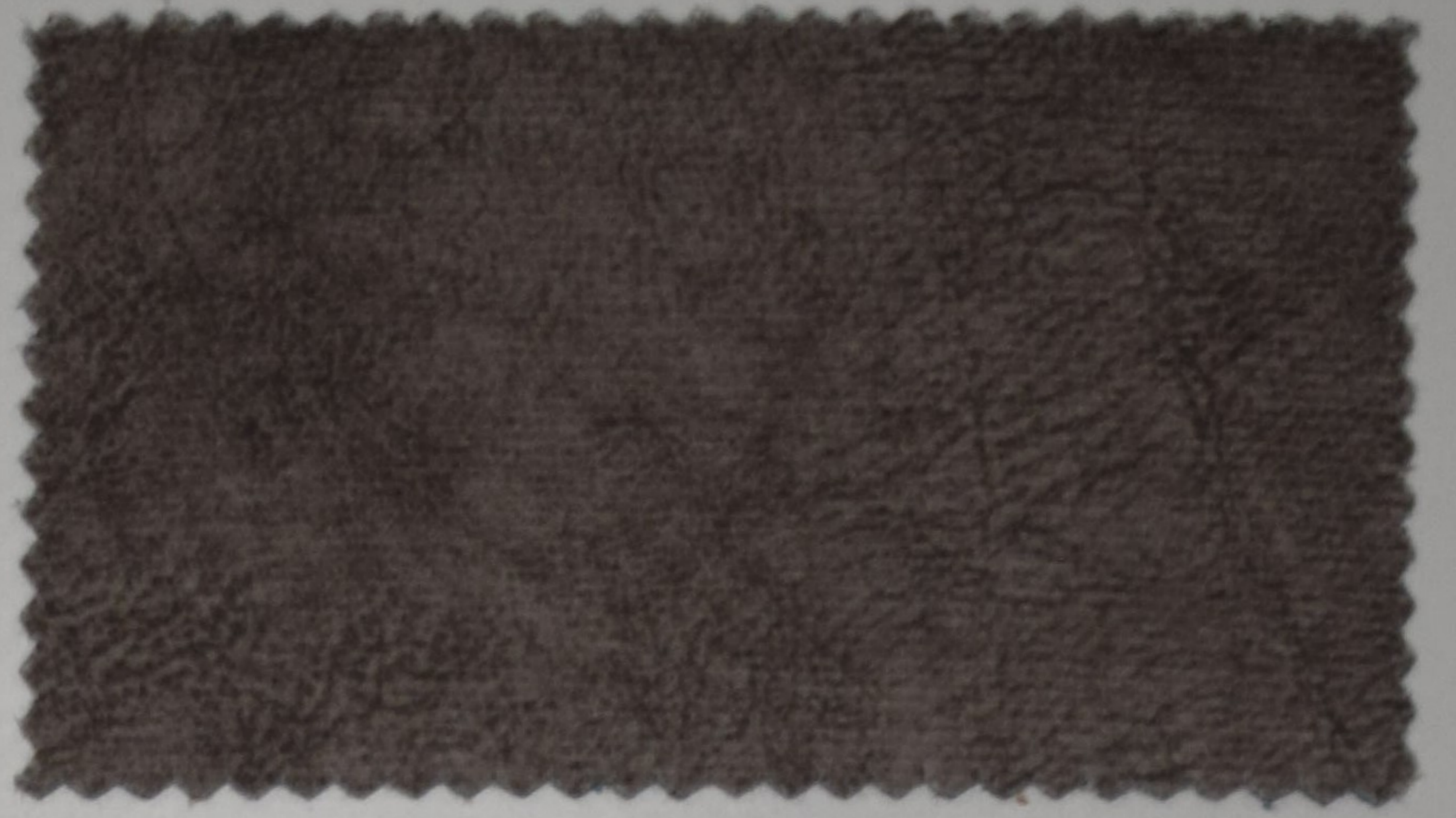
Shade No.- 102