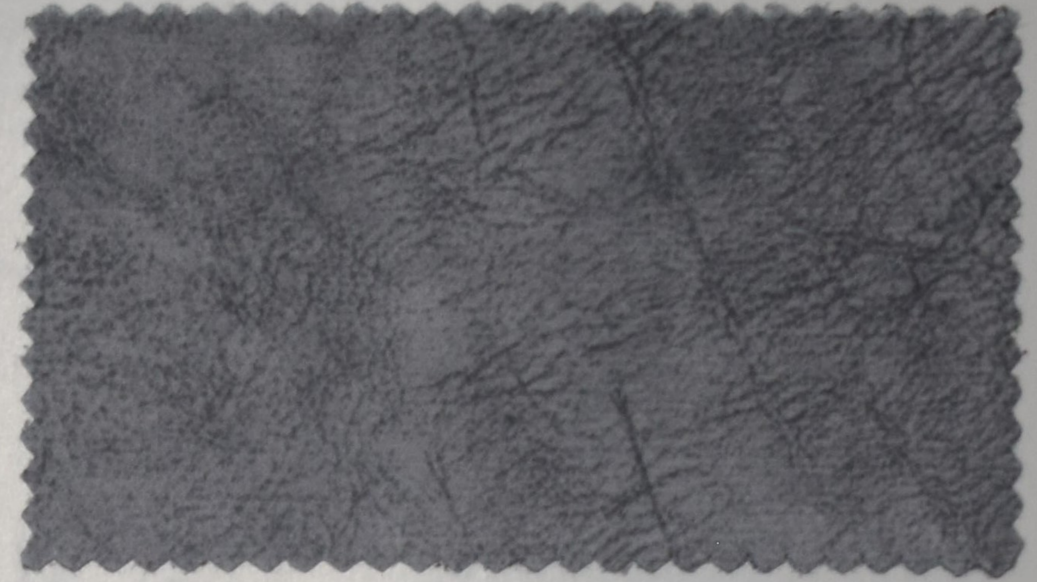
Shade No.- 106