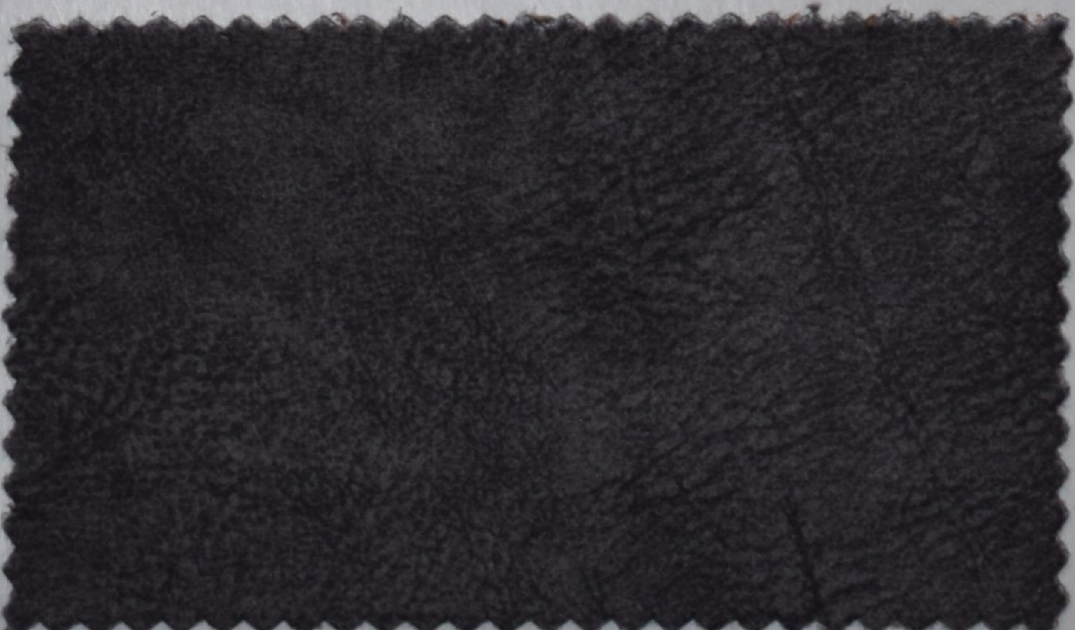
Shade No.- 114