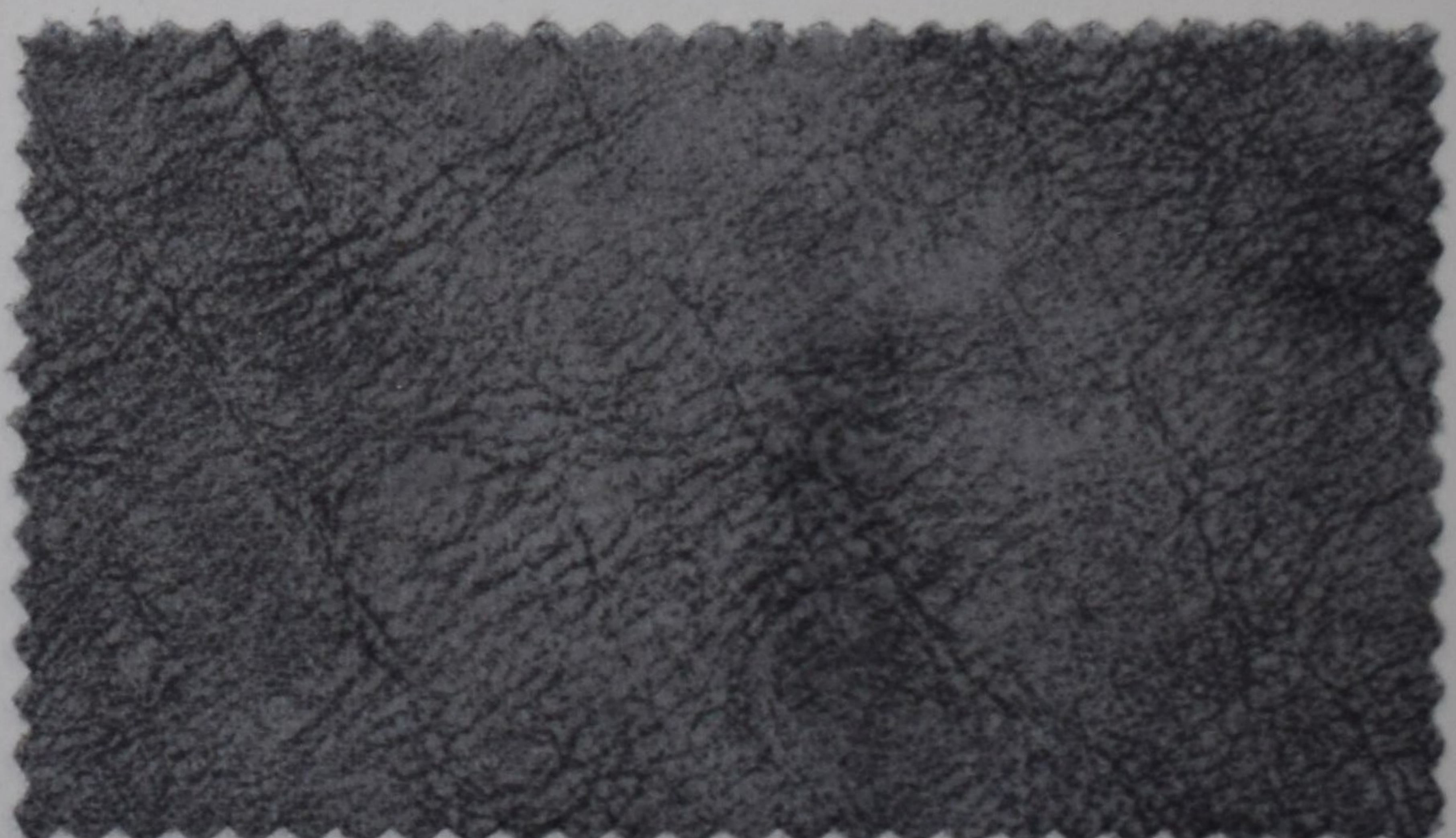
Shade No.- 113