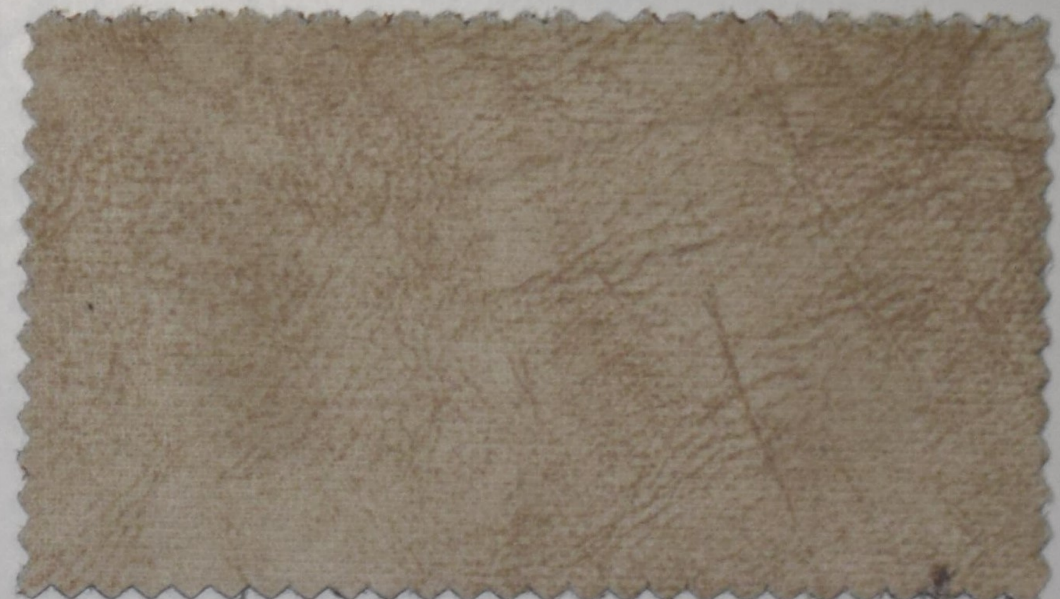
Shade No.- 110