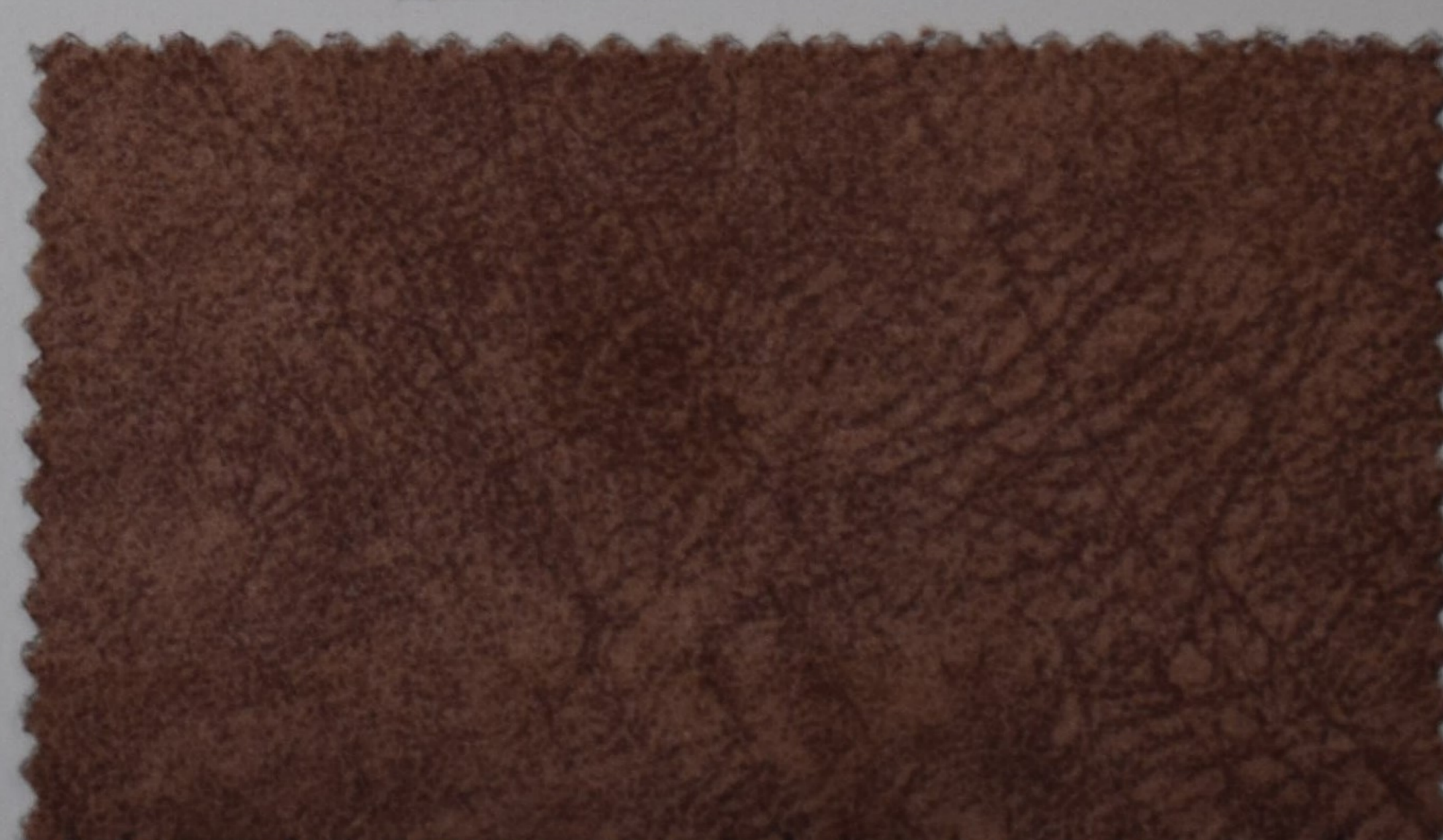
Shade No.- 116