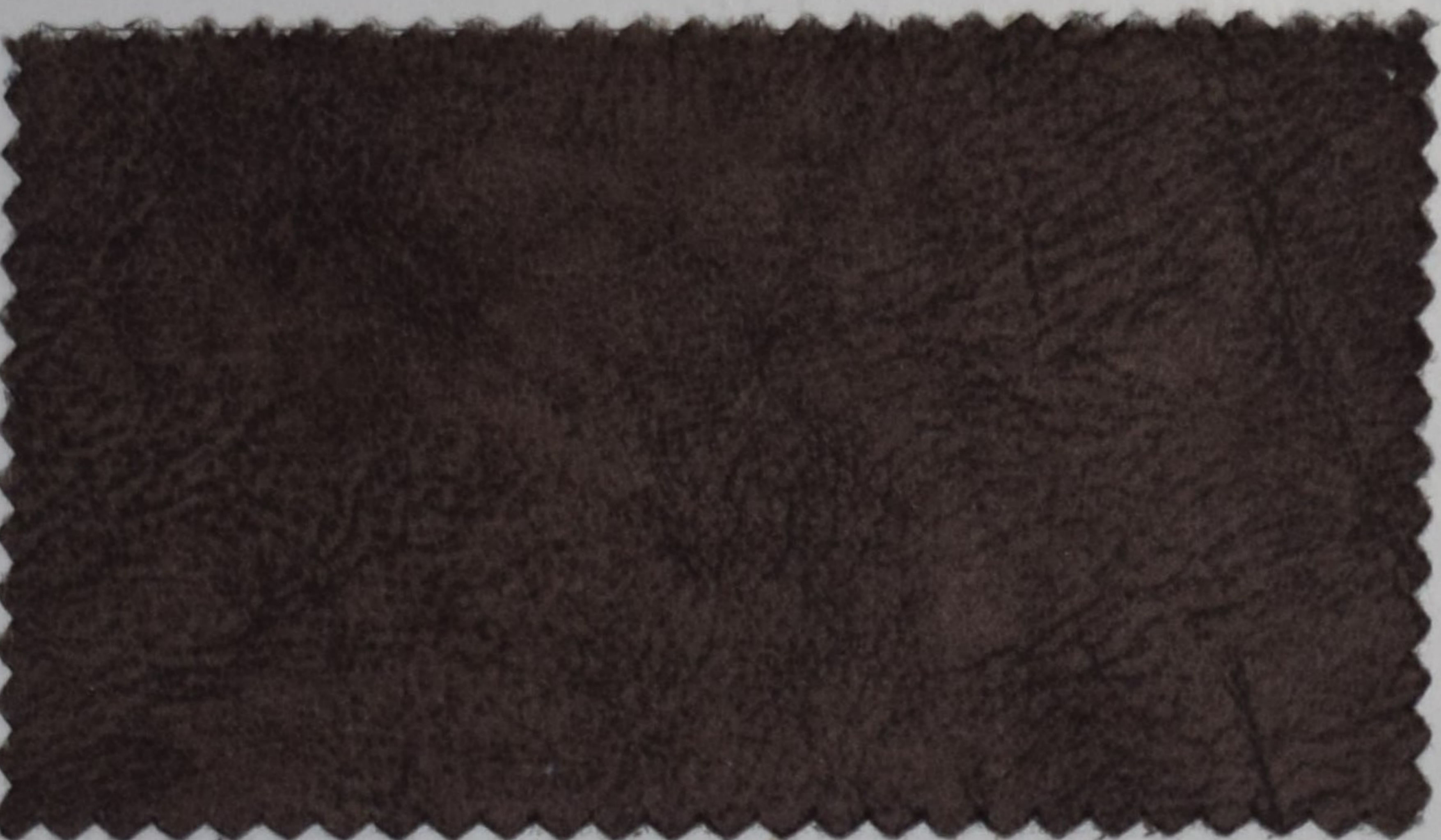
Shade No.- 107