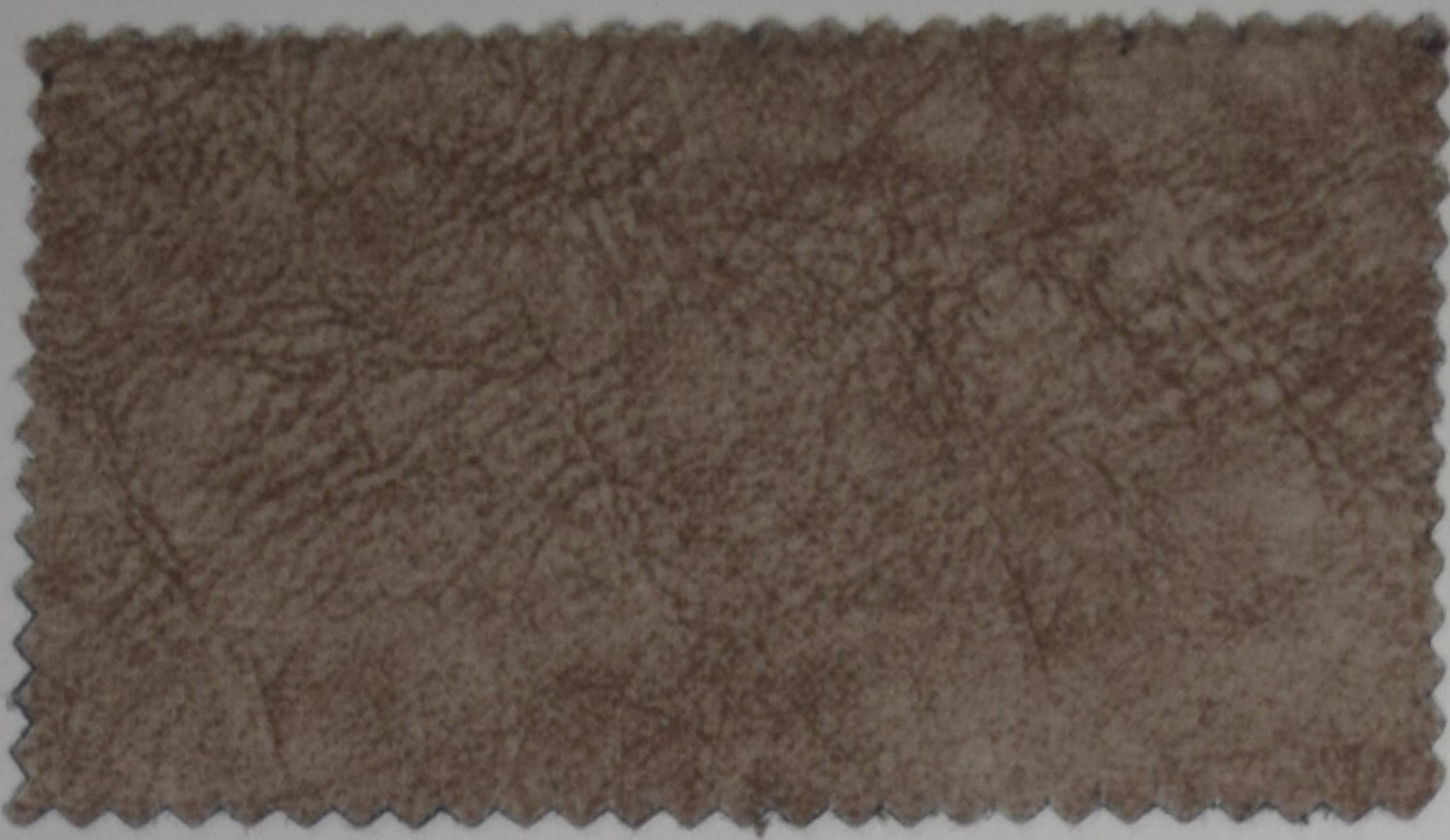
Shade No.- 101